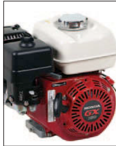
Genuine Honda GX270 9HP Engine