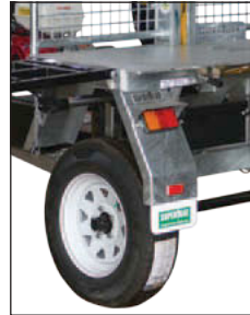
Galvanised Frame A durable, anti-corrosive finish that will withstand the rigours of the harsh NZ coastal climate