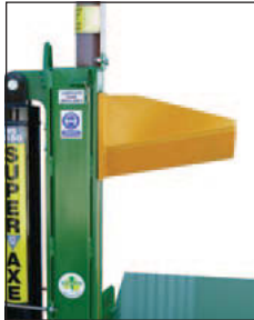
Patented Vertical Splitting Action Blade 21 Tons Force