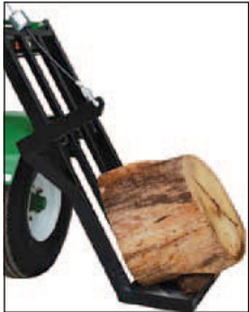
Back Saving Log Lifter 150 Model: Cable & Pulley 3150 Model: Hydraulic

BOTH THE WS150 MODEL, AND THE LARGER WS3150 FEATURE THE FOLLOWING