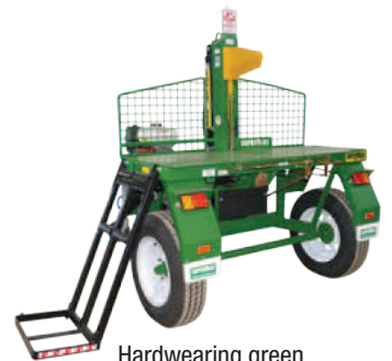
Hardwearing green paint finish option.

Featuring a stronger, 200kg capacity log lifter, bigger wheels and a bigger workbench, the WS3150 is more suited to high volumes, larger wood and easier towing over long distances.