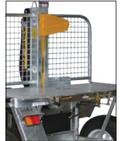
Guards and Two Handed Controls For enhanced safety