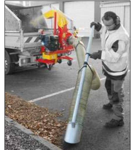
WINDY 491 RE