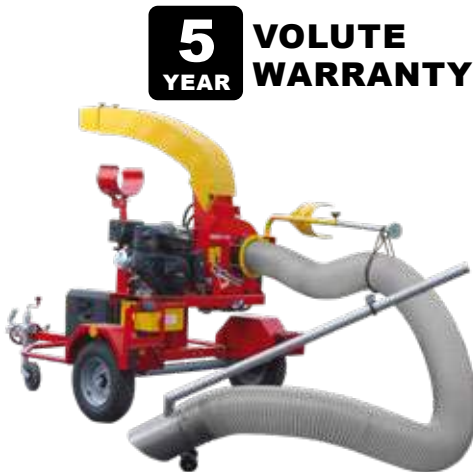
WINDY 491 ME