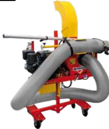
WINDY 491 RE