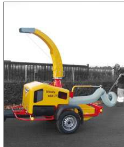
WINDY 660 ME