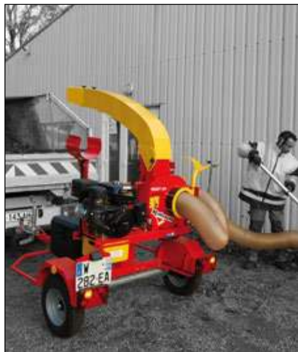
WINDY 491 ME