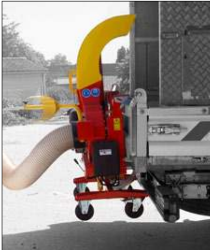
WINDY 491 RE